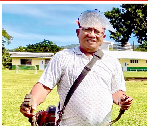
Trades and Maintenance of the Year Page 10