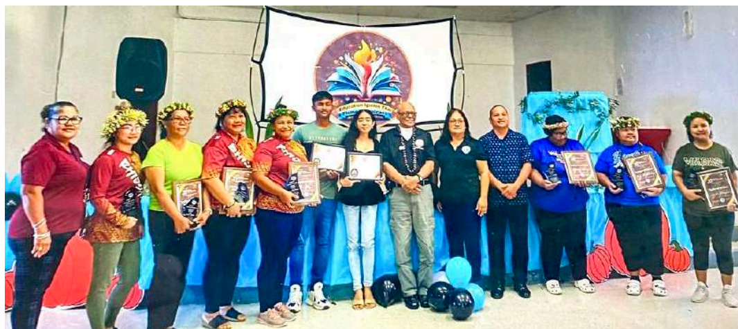
Dr. Rita Hocog Inos Junior Senior High School's Education Day Teacher and Staff Awardees are honored.