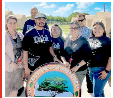
Teacher Aide of the Year Page 5

'PSS works hard to give our children the education they need... and its possible because we have professionals in various roles committing themselves to the success of our students'