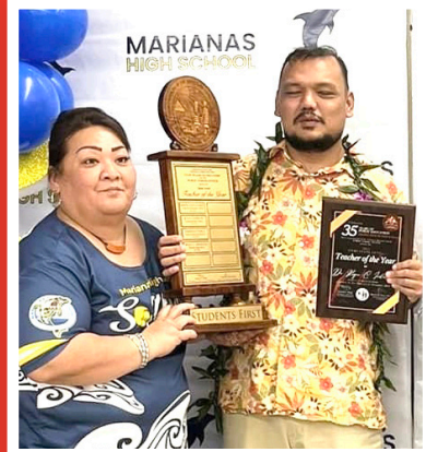
Teacher of the Year Page 2