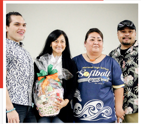
US Territory's History Teacher of the Year Page 12