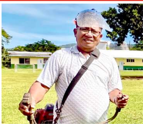
Trades and Maintenance of the Year Page 10