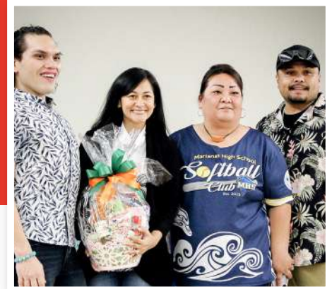
US Territory's History Teacher of the Year Page 12