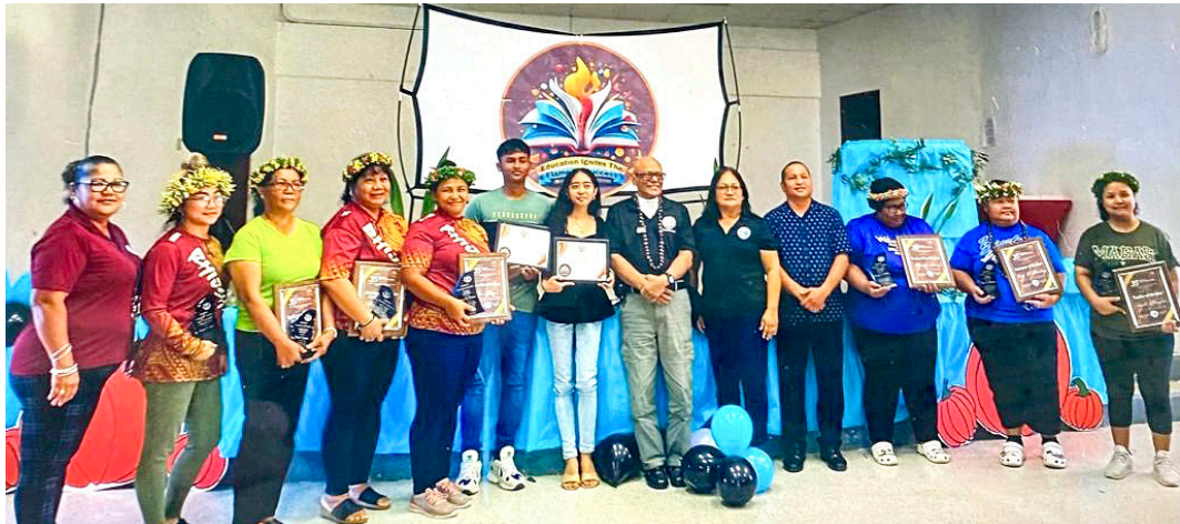
Dr. Rita Hocog Inos Junior Senior High School's Education Day Teacher and Staff Awardees are honored.