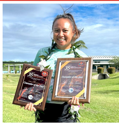
Counselor of the Year Page 7