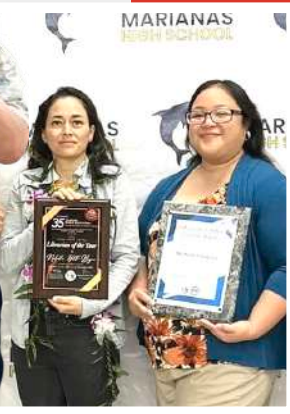
Librarian of the Year Page 4