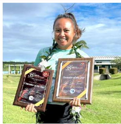
Counselor of the Year Page 7