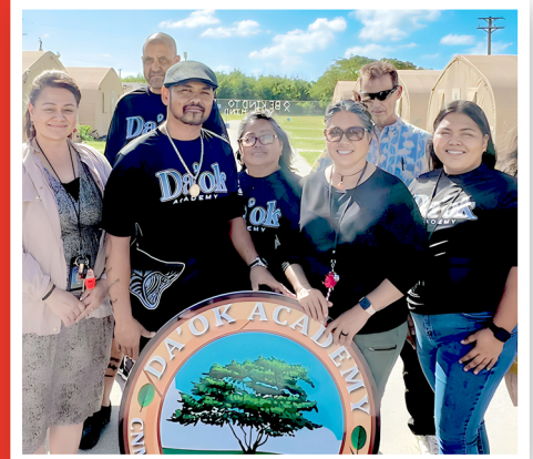
Teacher Aide of the Year Page 5

'PSS works hard to give our children the education they need... and its possible because we have professionals in various roles committing themselves to the success of our students'