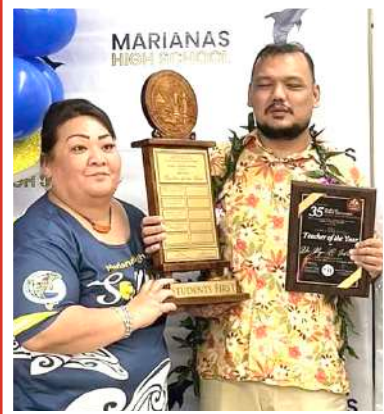
Teacher of the Year Page 2