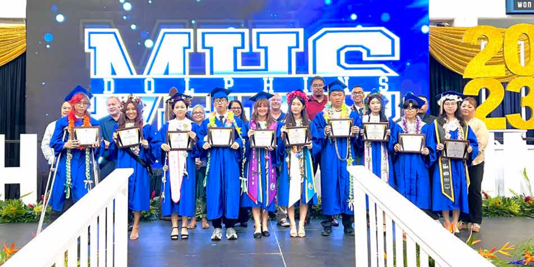
Community members from Saipan, Tinian and Rota paid tribute to the Marianas High School Class of 2023 on Tuesday afternoon at the MHS gymnasium, which was filled to capacity.