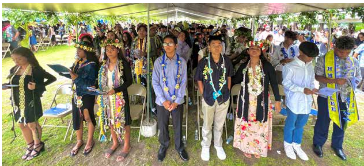
The 8th grade promotes of Hopwood perform their class song, “I Lived” by One Republic.