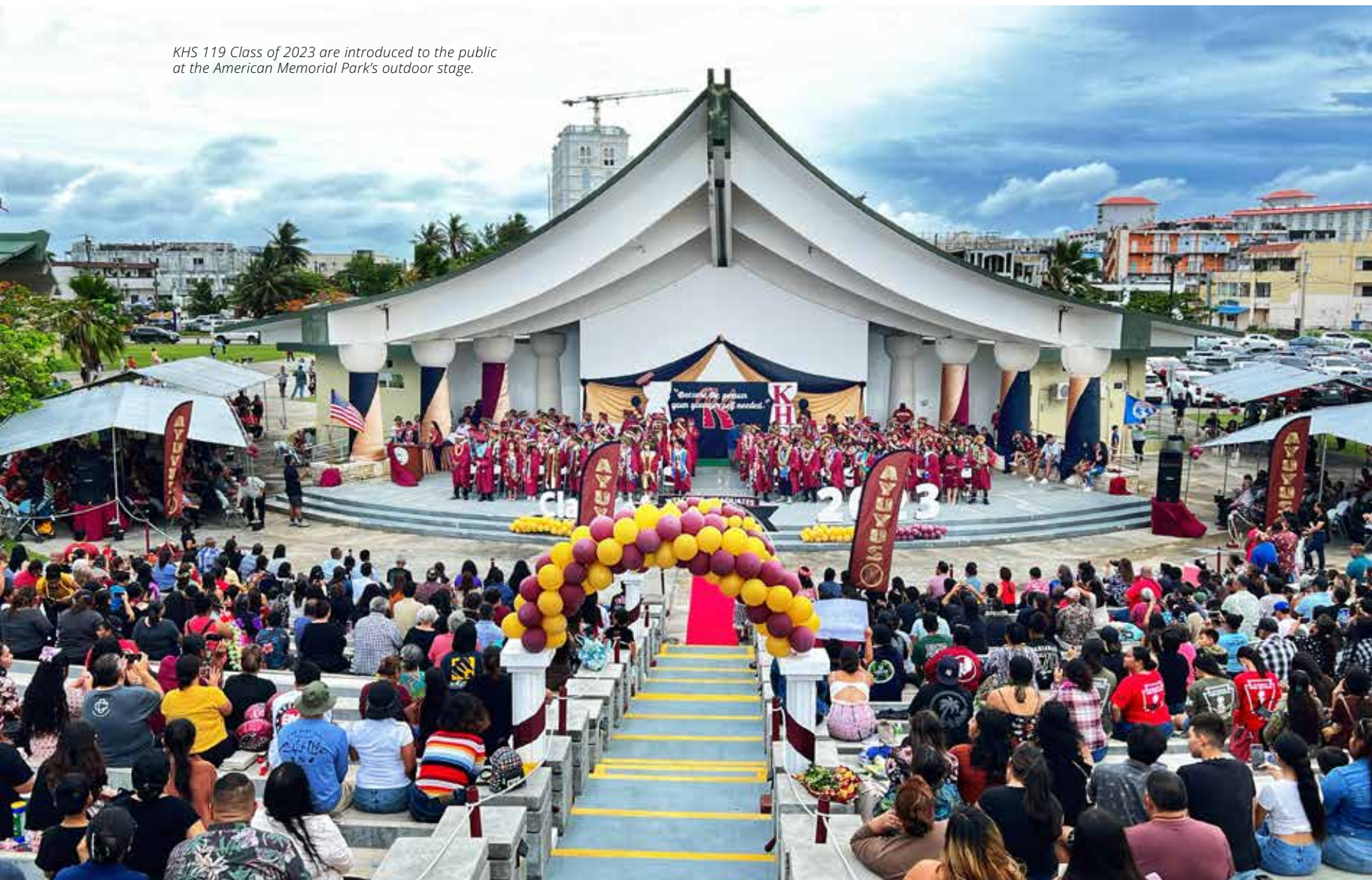
KHS 119 Class of 2023 are introduced to the public at the American Memorial Park's outdoor stage.