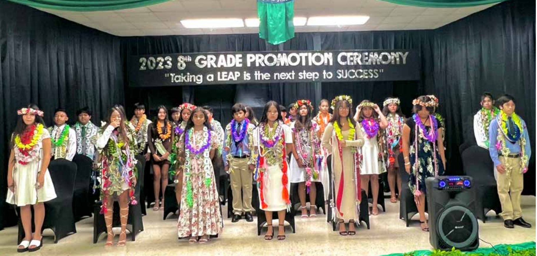
The 28 promoted students at Tinian Junior High School are introduced to the public.