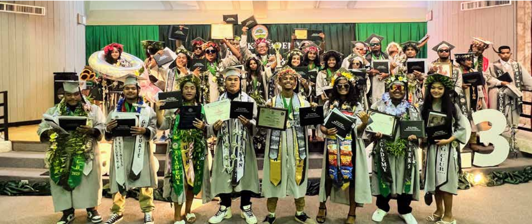
The 31 graduates belonging to Da'ok Academy's Class of 2023 proudly displays their certificates, trophies and medals following their commencement ceremony in the afternoon of June 5th at the Governor Pedro P. Tenorio Multi-Purpose Center.