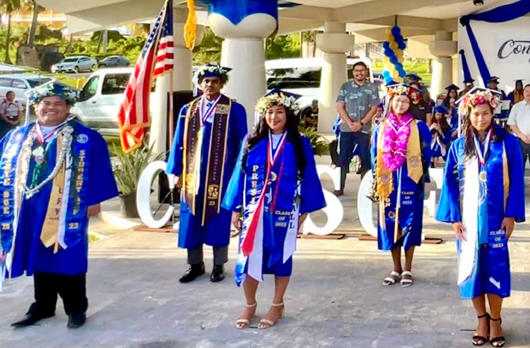
caption caption caption