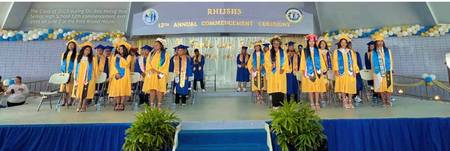
The Class of 2023 during Dr. Rita Hocog Inos Senior High School 12th commencement exercises on June 2 at the Rota Round House.