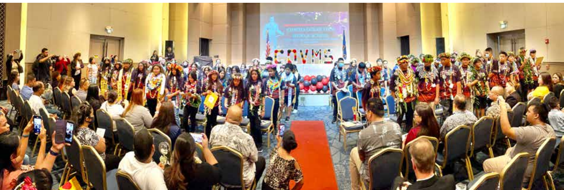
The 80 promoted Chacha Oceanview Middle School students perform to their families, friends and the community during the culmination of their promotion ceremony last Wednesday at Saipan World Resort.

“To my lolo and lola, you have been the foundation of our successes as a family. You have given you children the wisest of wisdoms to carry over us, to your grandchildren.”